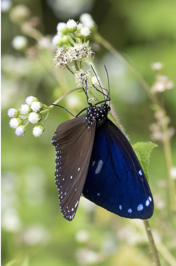
Winner - Non-UK category Blue-banded King Crow in Borneo, by Ian Small