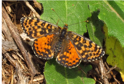
Spotted Fritillary ssp. meridionalis

Alas, this was holiday time and the roads were chaotic. Down to one lane on the route to the summit with every manner of transportation parked or abandoned on either side of the road.