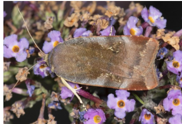
Lesser Broad-bordered Yellow Underwing