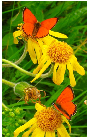
Scarce Coppers Female (left) Males (right)