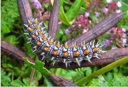
Spotted Fritillary Caterpillar

dramatic landscape and friendly people. If your French is up to it and you want a deeper insight into the area's butterflies then try looking at the website of the Société d'Histoire Naturelle Alcide - d'Orbigny www.shnao.net/index.php Here you will find a link to an archive of Arvernsis, the Bulletin des Entomologistes d'Auvergne. The direct link to the archive page is www.shnao.net/arvernsis.php .