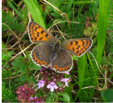
Female Sooty Copper

( Lycaena virgaureae ) was conspicuous on every visit, its flash of orange clearly visible from a distance. More colour was added to the scene by the Fritillaries: Silver Washed Fritillary ( Argynnis paphia ), Knapweed Fritillary ( Melitaea phoebe ), and Small Pearl-bordered Fritillary ( Boloria selene ). Great Banded Grayling ( Brintesia circe ) also appeared one afternoon to nectar alongside several Maps.